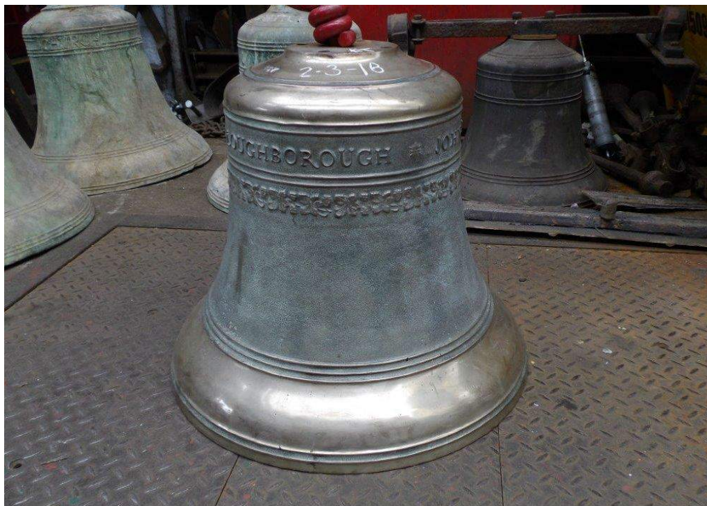
One of the Taylor bells donated to the Drayton Bassett scheme